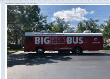
Bia Red Bus for TC