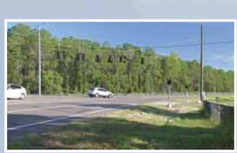
Street light at Crews Lake Middle School