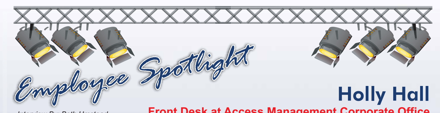
Interview By: Beth Umstead